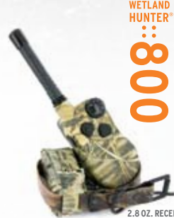
2.8 OZ. RECEIVER / 3.2 OZ. TRANSMITTER