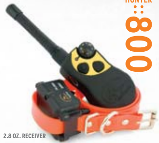
2.8 OZ. RECEIVER

The rugged, versatile SportHunter® Series excels in all environments and is especially suited to upland and multi-dog hunting situations. With blaze orange collar straps, they can be seen from a distance and readily located if dropped in the field. The SportHunter Series can be expanded to control multiple dogs by adding SportDOG Brand® Add-A-Dog® collars. With the comfortable "soft coat" transmitter finish, these units are a pleasure to use.