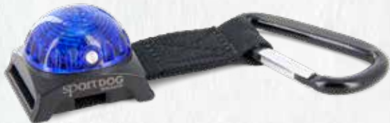
SHOWN WITH INCLUDED CARABINER ATTACHED