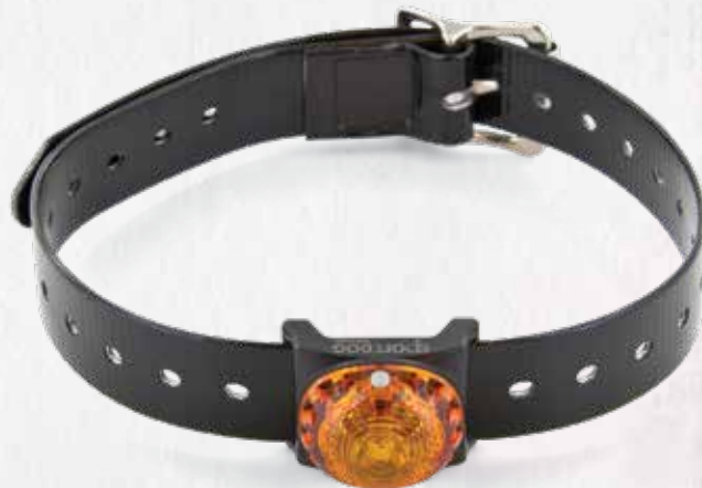
SHOWN ON 1" COLLAR STRAP